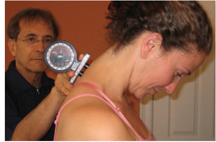
An inclinometer can be used to give a precise measure of cervical spinal curvature, both in a neutral position and in flexion.