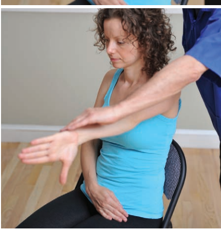
The first AIS hyperextension stretch and three additional starting positions.

An average person can lift about 10-15 pounds using this muscle. When we go on vacation, our suitcases usually weigh a good deal more (often 30-40 pounds). It is likely that dealing with the suitcase—lifting it, carrying it around, putting it into the trunk of a car, lifting it up to place it in the plane's overhead bin, etc.—was the precipitating event that led directly to the injury. What is causing the pain now (the direct cause) is the result of that event: tears in the supraspinatus muscle and/ or tendon and the resulting adhesive scarring. There may also be additional factors that predisposed this person to injury, such as a lack of strength or flexibility, muscle tension, or poor body alignment. These are indirect causes.