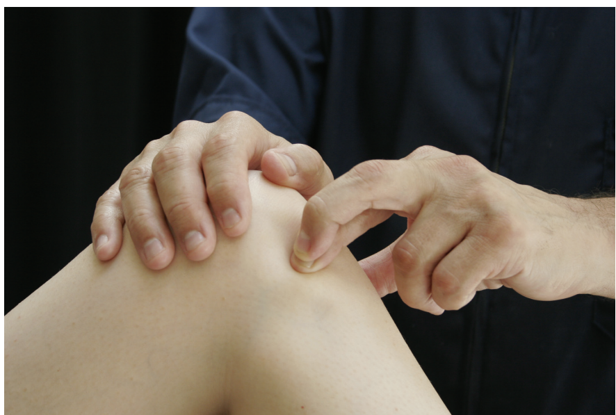
Friction of the medial coronary ligament.

Stand at the side of the table near the knee you’ll be working on. Have the client’s leg bent at a 90° angle with the foot on the table. Now turn the foot laterally; this makes the ligament more accessible. Stabilize the leg by placing your headward hand on top of the knee with a downward pressure. Place the index finger of your footward hand on the medial tibial shelf with the middle finger on top of it for support. Friction toward or away from you, while pressing very firmly down onto the tibial shelf, for five or six minutes. Be sure to bring the client’s →